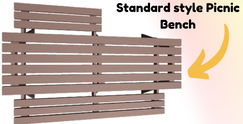
Standard style Picnic Bench

Upgrade your sponsorship to the Silver level and make a lasting impression on the community. In addition to the benefits of the Bronze package, you'll receive a standard style picnic bench, complete with a personalised plaque showcasing your company's name or logo. Your sponsorship also includes a contribution towards our community bench, reinforcing your commitment to community development. These community benches are purchased with funds raised through our community fundraising efforts and smaller donors and will bear a plaque acknowledging the community's contribution. As an official sponsor recognised in our brochure, your brand gains visibility among community members and stakeholders. Enjoy exclusive access to the installation day event, where you can network with fellow sponsors and project organisers while capturing the excitement with a personalised photo opportunity. Extend your reach further with two personalised social media tags and mentions across multiple platforms over a 12-month period, amplifying your brand's visibility and engagement.